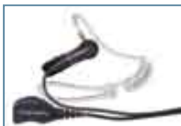
2-Wire Surveillance Kit with Clear Acoustic Tube PMLN4606