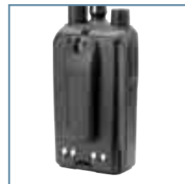
Mag One Standard Belt Clip PMLN4691_R