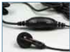
Mag One Earbud with In-line Microphone and PTT/VOX Switch PMLN4442