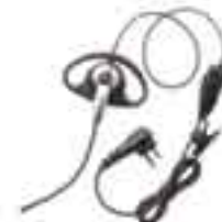
D-Shell Earset with Boom Microphone with PTT/VOX Switch PMLN4658