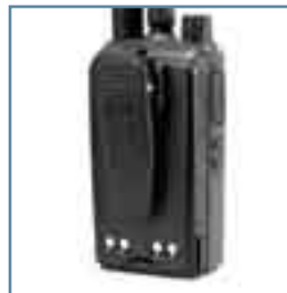
Mag One 2" Spring Belt Clip PMLN4743