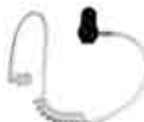
Clear Acoustic Tube PMLN4605