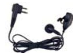
Earbud with Microphone and PTT Combined PMLN4294