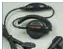
Mag One Ear Receiver with In-line Microphone and PTT/VOX Switch PMLN4443_B