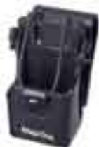
Mag One Hard Leather Case PMLN4742