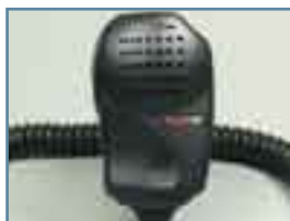
Mag One Remote Speaker Microphone PMMN4008