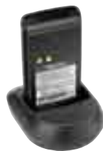
Mag One 6-hour Mid-rate Charger Kit (includes Base and Transformer) PMLN4738_R Mag One 12-hour Slow Charger Kit (not pictured, includes Base and Transformer) PMLN4683_R