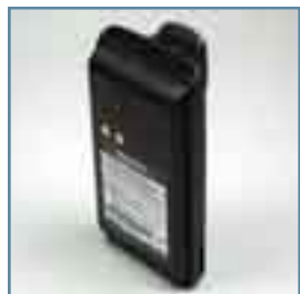
Mag One 1200mAh NiMH Battery PMNN4071_R